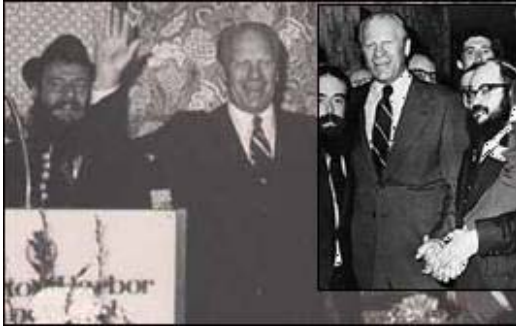
President Gerald Ford (1974-1977)